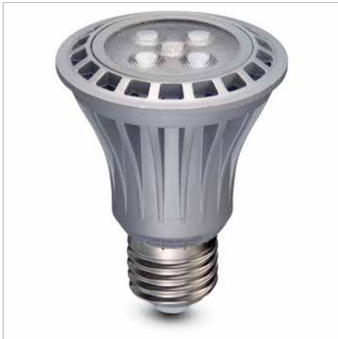
PAR20 LED ALTAIR