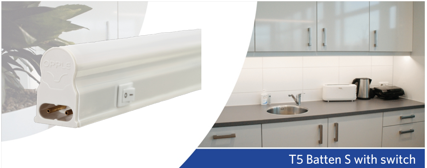
T5 Batten S with switch