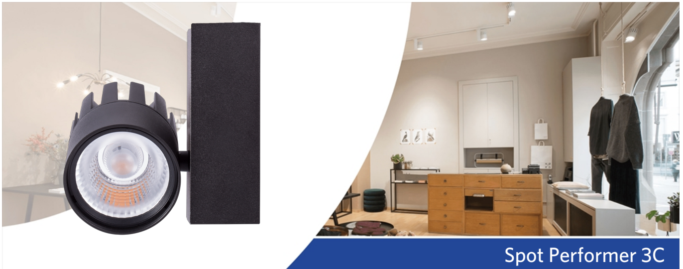
Spot Performer 3C