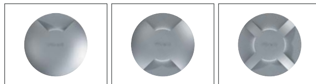
01: Single sided