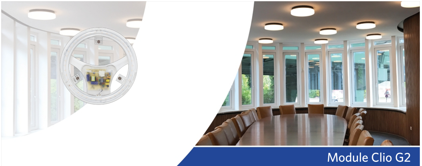
Module Clio G2