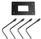
703098000300 LEDBollard-Luke-E Concrete-Mounting-Kit