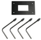
703098000300 LEDBollard-Luke-E Concrete-Mounting-Kit