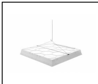
Safety suspension (modular ceiling) (904349)